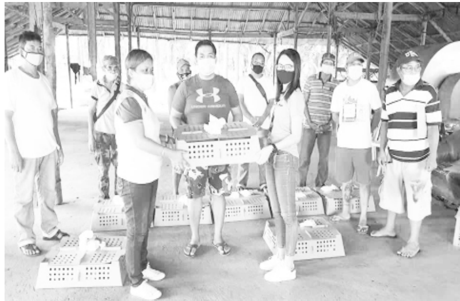
The Department of Agriculture – Region 4A granted 800 DOC broilers to 16 farmer beneficiaries (50 heads each) of Trece Martires City. Poultry dispersal was conducted by the City Agriculture Office yesterday, July 23, 2020 at the City Forest Park.